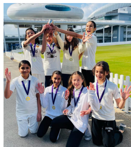
Ealing Girls U12's

Ealing won the toss and decided to field. Their tidy bowling was restricting Highgate's runs until the final pairing, who scored freely leaving Ealing a target of 105 to win. The middle order proved too strong for the Highgate bowling, finally giving Ealing victory by 35 runs.