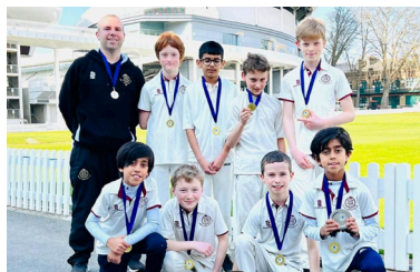
Nth Mddx U11's

Nth Middlesex edged Stanmore in a fiercely contested and well balanced final at Lord's. The match went down to the final ball with all three results possible. Nth Mdx. batted steadily setting Stanmore a total of 95. Tight Nth Mdx. bowling contained Stanmore with their final pair needing 4 runs with 5 balls to go. A game played in great spirit with either team capable of being champions.