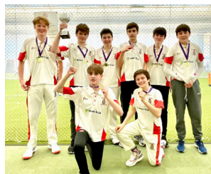
Stoke Newington U15's

Nth London elected to bat first with everyone contributing to a final score of 116. A combination of tight bowling and sharp fielding gave Nth London victory by 70 runs in what was a match played in the right spirit.