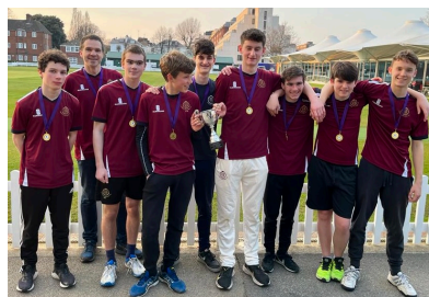
Nth Mdx U17's

R & F won the toss and decided to bat. The Nth Mdx bowling and fielding were excellent and restricted R&F to 84 runs. Nth Mdx was consistent with all pairs contributing, finally getting home with a total of 112 and a well deserved victory.